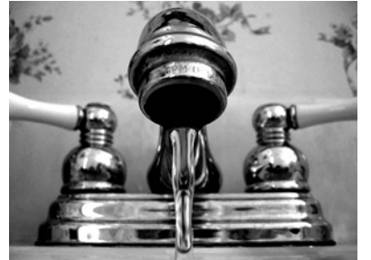
“Stuff” from the Faucet