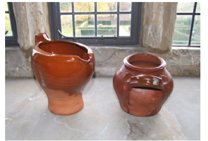
Chamber Pots / Night-Chairs

By the second half of the Twentieth century, the stuff coming out of the faucet ceased to be odorless, it was a new chemically engineered substance used as a cleaning fluid. The water that radiates purity has been transformed completely into H 2 O which must be chemically purified for human survival.